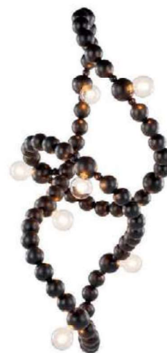
Brand Van Egmond Bella Chandelier Vertical