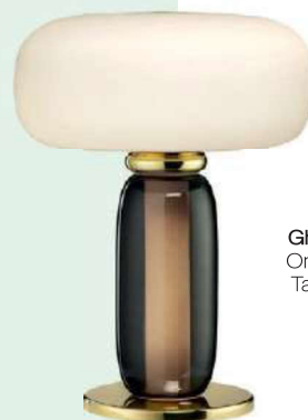
Ghidini 1961 One on One Table Lamp